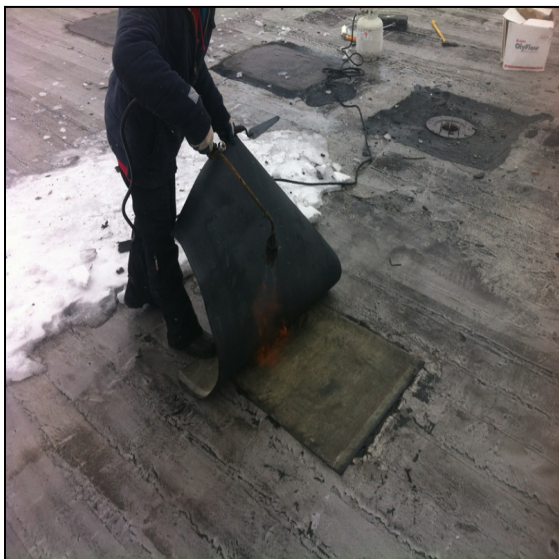
Photo 1 Notes: Removed stack installed steel decking and new insulation to match existing height of roof system.

Item of Inspection: Removed existing 8" cone flashing.