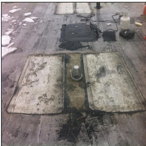
Photo 1 Notes: Removed snow, ice, and Installed new 6" spun aluminum drain insert.

Item of Inspection: Leak location at drain.