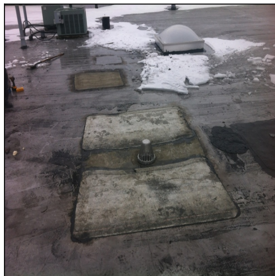
Photo 2 Notes: Flashed new drain with APP smooth modified per the manufacturer's specifications.

Photo 1 Notes: Removed snow, ice, and Installed new 6" spun aluminum drain insert.