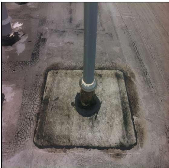
Photo 1 Notes: Installed new flashings up the vertical of the steel cone. ( Three total )

Item of Inspection: Re-flashed stack with APP smooth modified.