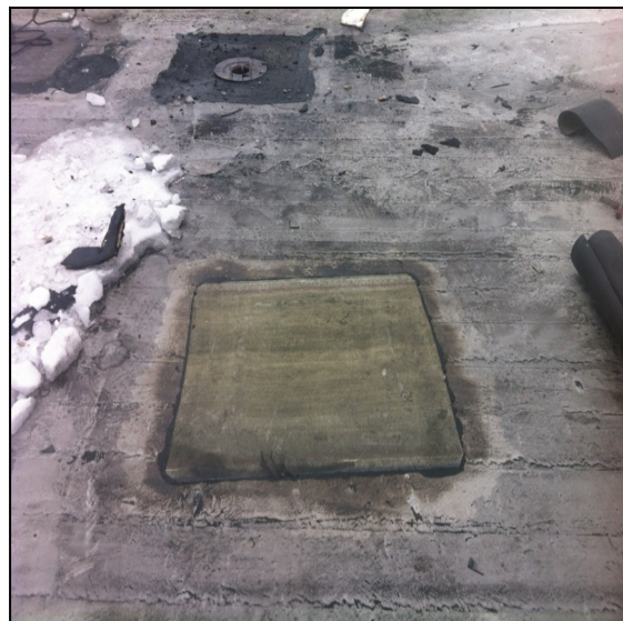
Photo 2 Notes: Flashd in with smooth modified to match existing roof system per the manufacture's spifications.

Photo 1 Notes: Removed stack installed steel decking and new insulation to match existing height of roof system.